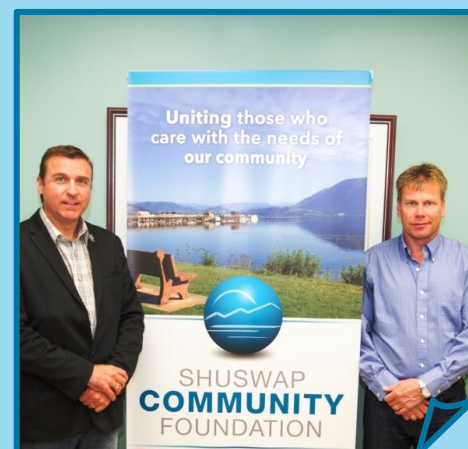
Kyllo Family Endowment