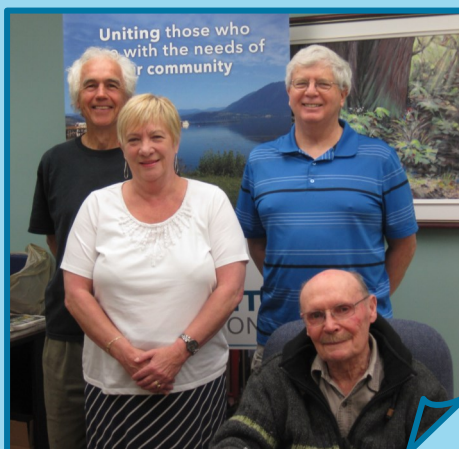
Aileen Gentles Memorial Endowment