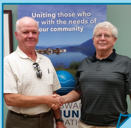
Seniors Resource Centre-Fletcher Park