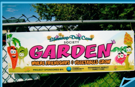
Project: Shed Replacement & Garden Area

Shuswap Daycare Society recently received a grant from SCF to replace the old shed on their property and to purchase four vinyl garden boxes for the garden area. Two sheds were built and finished, one for the children's play equipment, and the other for gardening supplies. This grant also enabled the Daycare Society to involve the children in the project—enriching the children's diets and teaching them to care for their gardens, as well as observing, comparing, and counting vegetables. This grant was made possible by the Wainwright Moblely Family Fund.