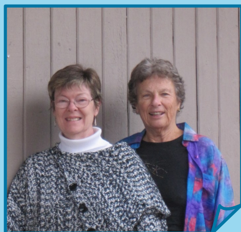
Shuswap Theatre Society Endowment